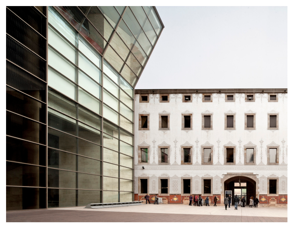
Pati de les Dones, CCCB.