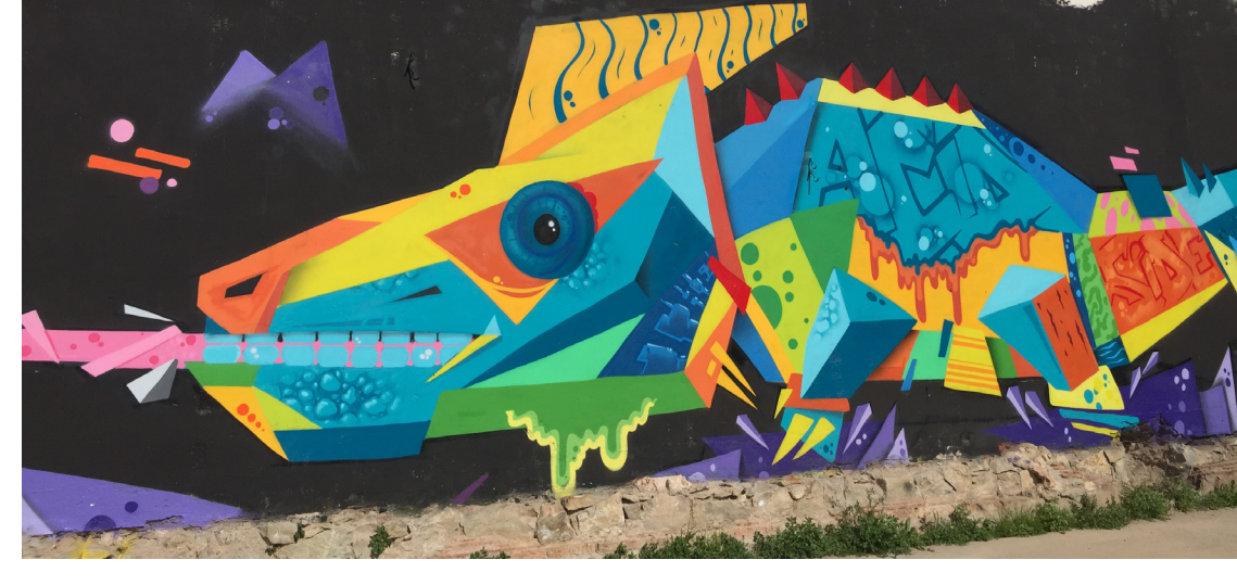
Street Art by Monkey Fingers in L'Hospitalet Cultural District.