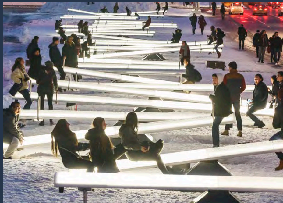
Image: Luminotherapie Impulsion 2, Ulysse Lemerise, OSA.