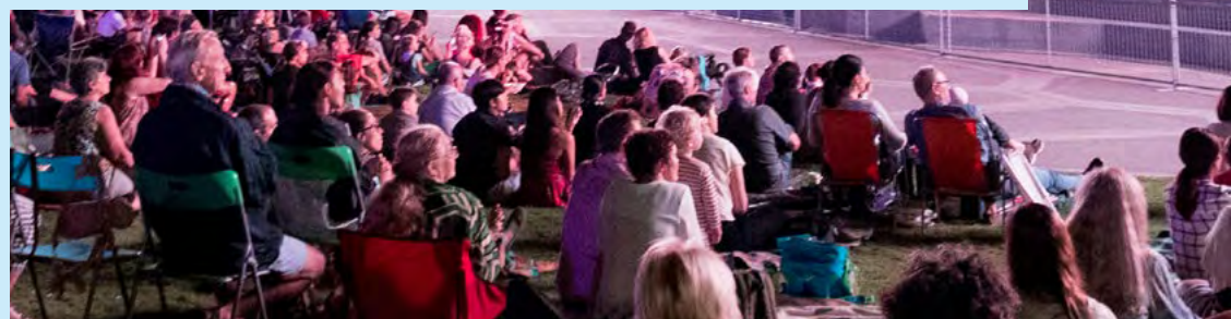
Image: Concert for the Planet.

GCDN partners with a number of complementary organisations to access intelligence, opportunities and profile through relevant networks. These include the International Downtown Association, the Association of Asia Pacific Performing Arts Centres and Pritzker Forum on Global Cities.